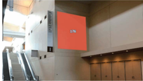
Upper Level Access (Upper) - Size: 15'W x 18'H Investment: $15,000