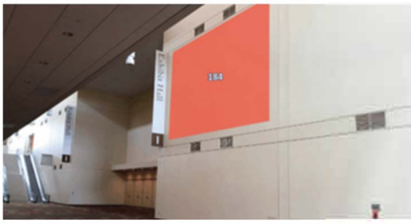
Over Registration (Left) - Size: 20'W x 18'H Investment: $15,000