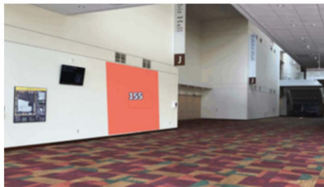
Exhibit Hall Entrance (Right) - Size: 20'W x 10'H Investment: $15,000