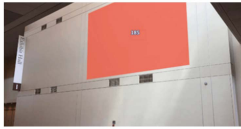
Over Registration (Right) - Size: 20'W x 18'H Investment: $15,000