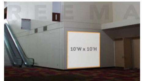
Upper Level Access (Lower) - Size: 10'W x 10'H Investment: $10,000