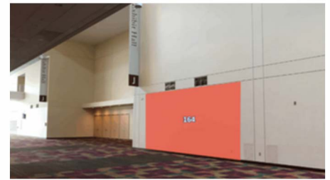
Exhibit Hall Entrance (Left) - Size: 20'W x 10'H Investment: $15,000